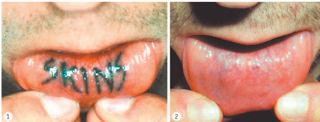
Fig. 1. Blue-black amateur tattoo on inner side of lower lip.

Recently, new indications have been described for the use of Q-switched lasers. Removing amalgam tattoos, which consist of the deposition of metallic particles (eg, silver, mercury, copper, zinc, and tin) into