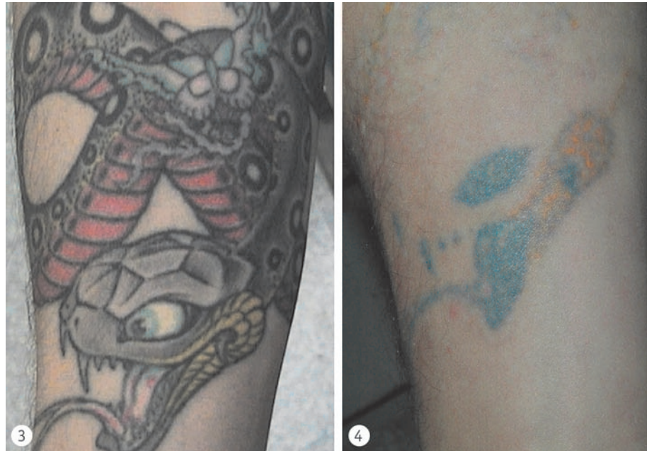
Fig. 4. Despite 12 sessions with Q-switched Nd:YAG laser at 532 nm and 1064 nm darkening still persists. Also note that yellow colour resists treatment. This was mentioned to the patient before starting laser removal.

be removed. This technique is called “retattooing” (50). But he (she) often forgets that the final tattoo in fact covers another one. Patients with a tattoo should always be asked if they have a retattooed motif. The scarring phenomenon occurs probably because of the high density of pigment in this type of tattoo and the very strong absorption of energy by it. This produces heat so intense that it causes damage even to the surrounding dermis. Retattooing can also be a possible cause of resistance to pigment as both tattoos have not been done at the same time by the same artist. Different pigments have been used, increasing the difficulty of removal by Q-switched lasers.